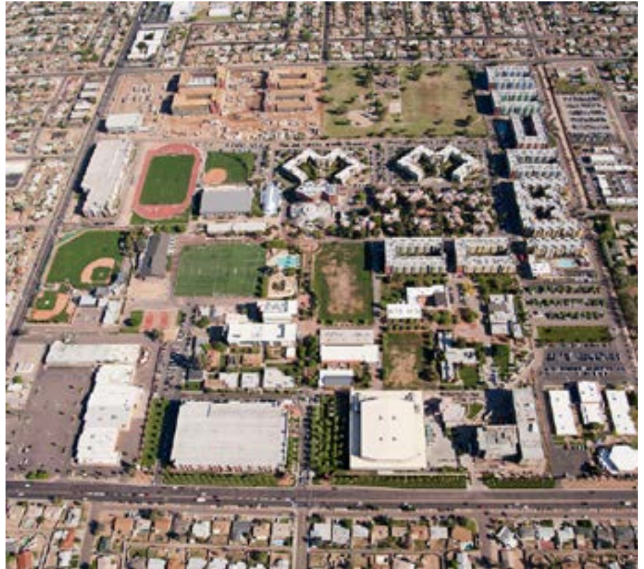
Bird's eye image of the main GCU campus

The Alhambra Village Planning Committee, Planning Commission and ultimately the Phoenix City Council approved a major amendment to the Grand Canyon University Planned Unit Development (PUD). This allowed the university to expand their boundary, change development standards and add uses to support future growth of the campus. The request included the addition of restaurants, campus security, medical and counseling services, transportation services, and a hotel use all within the area generally bound by 35th Avenue on the west, Missouri Avenue on the north, Black Canyon Freeway on the east, and Camelback Road on the south.