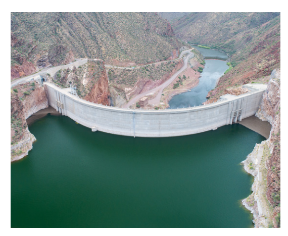
Roosevelt Dam on the Salt River

Glendale has a 100-year water supply for all existing and planned developments within the city's water service area and is capable of building the necessary distribution and treatment facilities to deliver high quality water to a growing community.