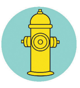
More than 8,400 fire hydrants maintained