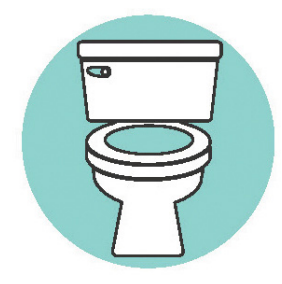
6 billion gallons of wastewater annually transported and cleaned (equivalent to 1.7 billion toilet flushes)