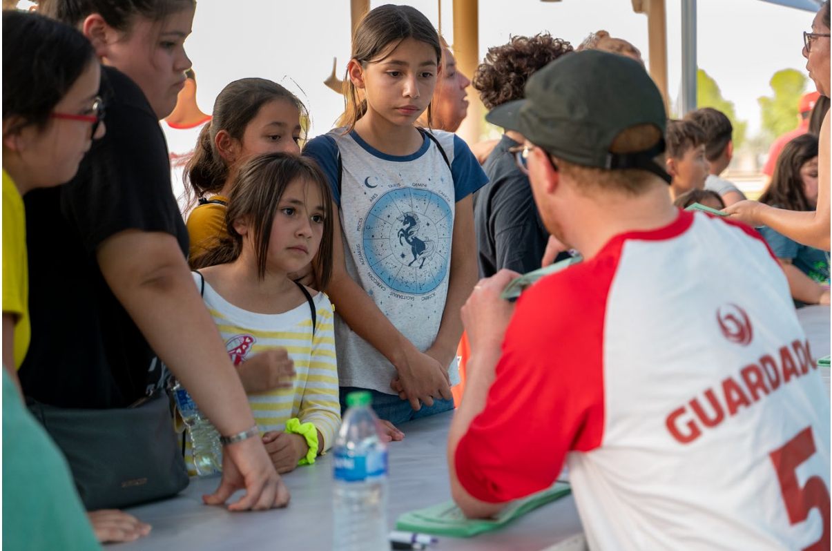
"Celebrating Our Encanto" at Mariposa Park