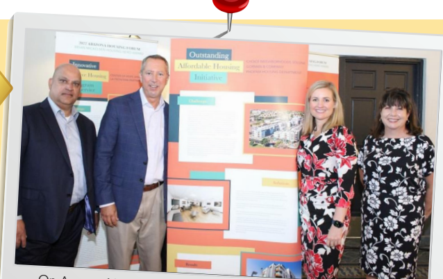
On August 19, Soluna Apartments was awarded a Housing Hero Award from the Arizona Department of Housing during its 2022 Arizona Housing Forum in the Exemplary Multi-Family Project category. This award recognizes an outstanding multifamily rental project in urban or rural Arizona that serves low to moderate income individuals, families or seniors.