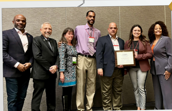
In September, Housing Department was recognized at the National Association of Housing and Redevelopment Officials (NAHRO) Annual Conference with an Award of Merit in Administrative Innovation for the Landlord Incentive Program.