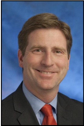
Mayor Greg Stanton

Honorable Members of the Arizona Congressional Delegation: