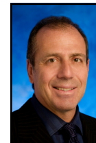
Sal DiCiccio Councilman District 6