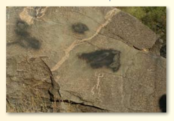
Even with careful removal methods, the damaged petroglyph will never be the same, and valuable information about the past can be lost forever.