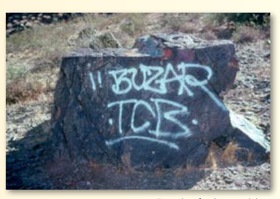
Examples of rock art vandalism

The time it takes to vandalize a rock art panel is only a fraction of the time it takes to restore it. Restoration can be extremely costly when done correctly. Using harsh solvents to remove paint is not appropriate, because it can damage the petroglyph.