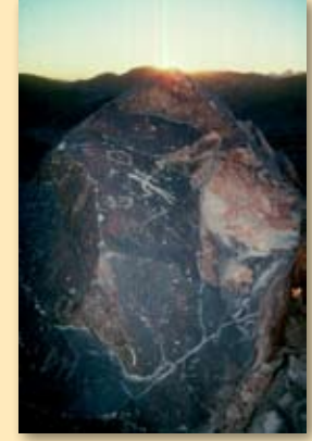
Context can reveal much about prehistoric features and artifacts.

Stay on trails. This is for your protection as well as the protection of the sites.