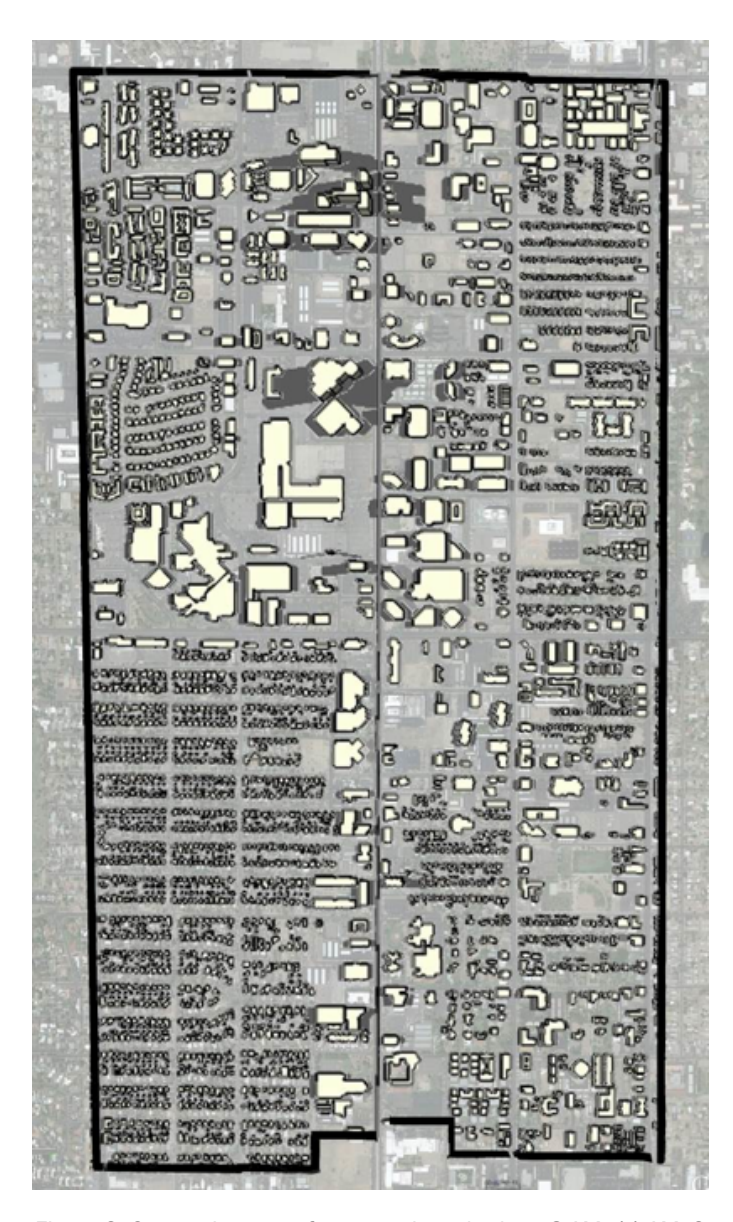
Figure 2. Composite map of summertime shade at 8 AM, 11 AM, 2 PM, and 5PM

Land use in Midtown consists largely of building footprints and parking areas, with few patches of landscaped area or vegetation. Thus, the District is confronted with various challenges in achieving sustainable green systems. Stormwater management and efficient water use is of particular concern, because the Valley faces an uncertain water future. Midtown also faces high temperatures from the Urban Heat Island (UHI) effect. Using building footprints and heights, Figure 2 shows shade and areas exposed to direct sunlight. In the summer, the predominant singlestory buildings offer very little shade. The north side of the District, characterized by taller buildings, provides the longest shadow coverage.