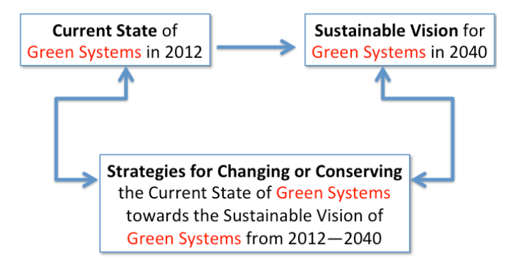
Figure 5. Transformational planning framework

In pursuit of these goals, we employ a transformational planning framework (Wiek, 2009; Johnson et al., 2011), conducting sustainable green systems research in three linked modules. We start with a thorough assessment of the current state of green systems in 2010/2012 against principles of livability and sustainability (current state assessment); in parallel, we create and craft a sustainable vision for green systems in 2040 (visioning); and finally, we develop strategies for changing or conserving the current state of green systems towards the sustainable vision of green systems between 2012 and 2040 (strategy building). The framework is illustrated below.