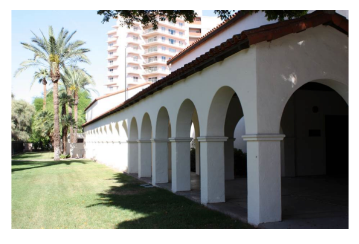
Figure 4. Shaded arcade/walkway at the Heard Museum

The Heard Museum also uses many heat-reduction techniques, including vegetation and shaded structures. It can be a significant example for heat reduction throughout the District as well as a valuable asset to educate residents on green system mitigation.