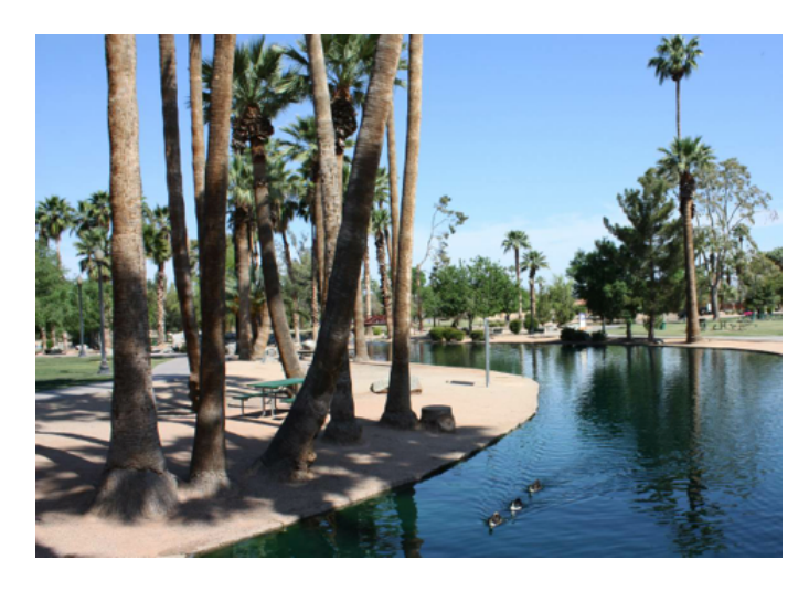
Figure 3. Encanto Park

The Heard Museum also uses many heat-reduction techniques, including vegetation and shaded structures. It can be a significant example for heat reduction throughout the District as well as a valuable asset to educate residents on green system mitigation.