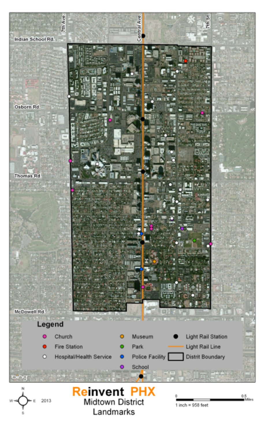
Figure 1. Major Midtown District streets and landmarks

The Midtown Transit District is located between 7th Avenue to the west, 7th Street to the east, Indian School Road to the north, and McDowell Road to the south. The parcels fronting onto the north side of McDowell, including the Phoenix Art Museum, are not included in the Reinvent Phoenix Midtown District.