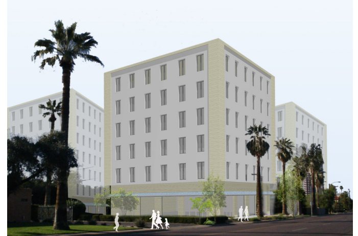
Figure 4. Visual Preference Survey Example

The visually-enhanced sustainability conversations (VESC) were designed allow residents to learn about potential investments, in order to jump start conversations about