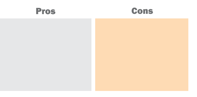
Figure 6. Steele Indian School Park Workshop

The preparation of the visioning workshops took place in several steps, including drafting of workshop activities and material, reviews, facilitator-training, run-through, dry-run, and so forth. All workshop activities were offered in English and in Spanish (simultaneous translation); for some breakout groups workshop activities were facilitated in Spanish only. The detailed guide of the visioning workshop is included in the Appendix to this report. Information about location, participants, etc. of the visioning workshops is compiled in Table 3 below.