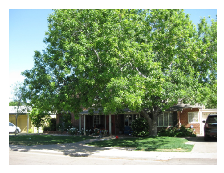
Figure 5. Single-family home in Windsor Square with large shading trees

Windsor Square is a mix of UHI challenges and assets. A designated historical neighborhood, the majority homes in this area were built in the 1930s. Homes with dense, mature vegetation are shaded, cooler areas. In the middle of the neighborhood, a circular median utilizes vegetation (trees and lawn) to cool the area. In contrast, however, homes with limited trees lack shade coverage, and therefore, contribute to warmer surface temperatures in the areas. This mix of cool and warm areas is prevalent throughout many neighborhoods in Uptown.