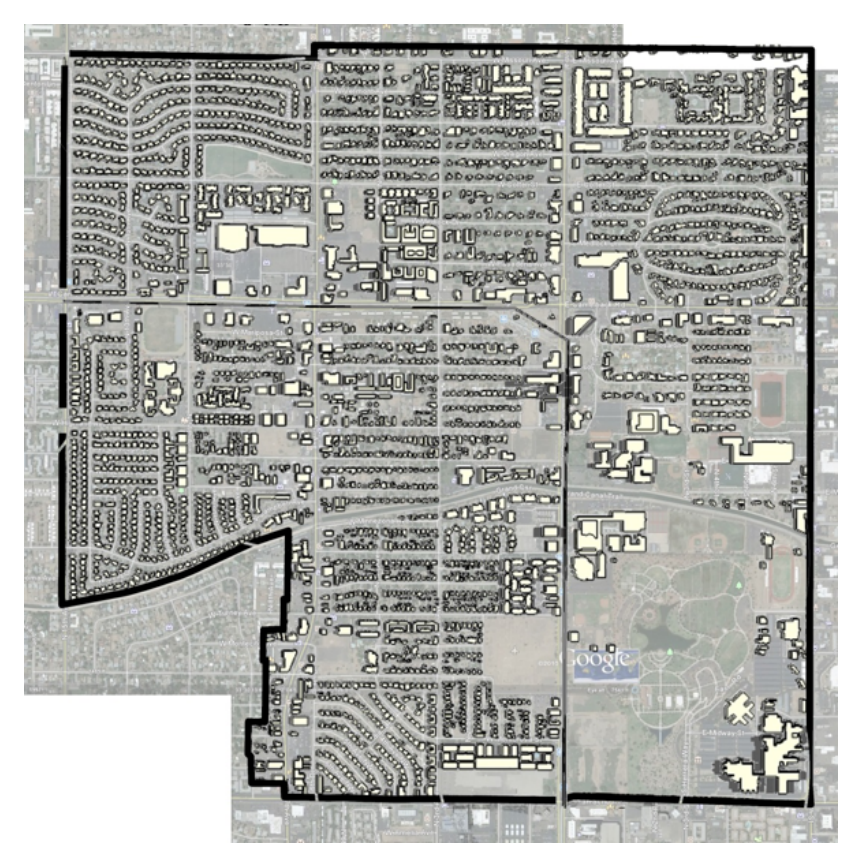
Figure 2. Composite map of summertime shade at 8 AM, 11 AM, 2 PM, and 5PM

Constructed in 1878, Grand Canal, which flows through the District between Campbell Avenue and Highland Avenue, was once a shady, tree-lined path. Today, the paths along the Grand Canal are still used for recreation, but the trees have disappeared. No longer a cool path, the canal currently has more asphalt and dirt than vegetation. Without shade to cool the pathway, temperatures will continue to rise in the future, and the canal will no longer be a viable recreational asset.