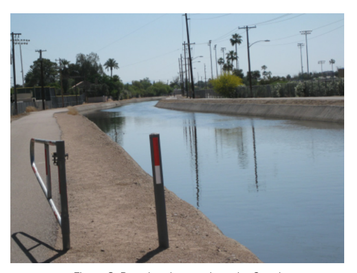
Figure 3. Paved pathways along the Canal

Constructed in 1878, Grand Canal, which flows through the District between Campbell Avenue and Highland Avenue, was once a shady, tree-lined path. Today, the paths along the Grand Canal are still used for recreation, but the trees have disappeared. No longer a cool path, the canal currently has more asphalt and dirt than vegetation. Without shade to cool the pathway, temperatures will continue to rise in the future, and the canal will no longer be a viable recreational asset.