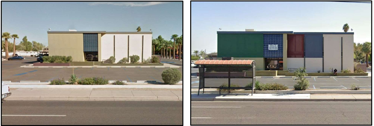
Figure 2 (above): Street view photography of existing structure at the property in 2016 (left) and 2021 (right) looking east on 7 th Street

This project provides an opportunity to redevelop this underutilized site into a neighborhood enhancing, luxury residential community. Development of the project will help to further diversify the availability of housing types and density ranges in the immediate surrounding area, as well as attract residents with disposable incomes to spend at the local retail and restaurant businesses within the 7 th Street corridor—furthering both the housing diversity goals 1 of the City of Phoenix General Plan, as well as the economic development goals 2 of the City of Phoenix Economic Development and Education Strategic Plan. 3