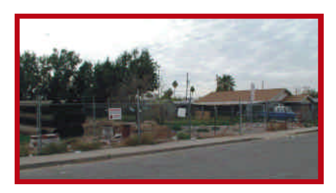
FIGURE 8 - Fenced Lot with Blight

GOAL5 ELIMINATION OF DETERIORATION AND BLIGHT: PREVENTION OR ELIMINATION OF DETERIORATION AND BLIGHT CONDITIONS SHOULD BE PROMOTED TO ENCOURAGE NEW DEVELOPMENT AND REINVESTMENT.