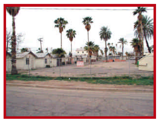
FIGURE 9 - Fenced Property with Abandoned Cottages

5. Upgrade obsolete and substandard infrastructure and improve natural habitat areas to encourage and support private investment.