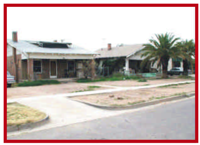
FIGURE 4 - Property maintenance violation

businesses in city programs with special emphasis on stabilizing property values, improving reinvestment and development potential, and increasing the safety and attractiveness ofneighborhoods.