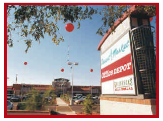
FIGURE 5 - Commercial Center Redevelopment in Sunnyslope

The complexity of urban problems in some areas of the city, and the costs to solve them, may require a long-term, phased and comprehensive approach that prioritizes resources. Incremental progress is possible through a comprehensive strategy that utilizes all city programs operating in the area to leverage private actions.