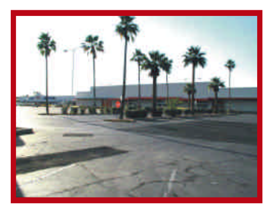
FIGURE 7 - Abandoned and Marginal Development

Maintaining occupied commercial and industrial buildingsprovidesapositiveimagefortheareaanda stable neighborhood environment that encourages and supports private reinvestment. Throughout the city, strip commercial buildings, 1960s-era malls, grocery stores, gas stations and big box buildings within commercialcentersarebeing abandoned, put to marginal use or are in need of a redesign and facelift. This type of building obsolescence is due to changing user needs, business consolidations and changing market conditions that no longer support long established businesses. Another factor is the