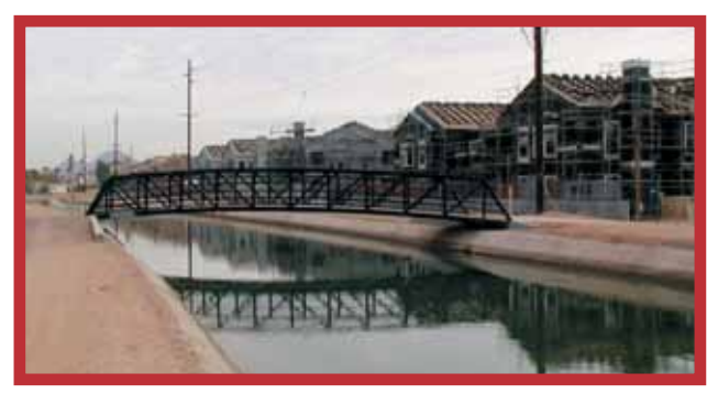
FIGURE 11 - Minnezona RDA Multifamily Project under Construction

Preserving viable communities or rebuilding those that have declined over years of neglect cannot be accomplished or sustained solely by the city. Because of limited, public funds, successful revitalization hinges on new funding sources and reinvestment by the private sector. These efforts involve the commitment and resources of businesses, civic groups and individual residents, using their own resources, finances, and time. Public resources should be strategically used as a catalyst to improve confidence and encourage others to participate in conservation, rehabilitation and redevelopment efforts.