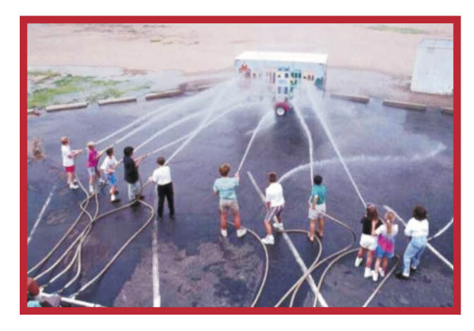
FIGURE 1 - Kids and Grownups Get to Try Out Fire Hoses and Check their Aim