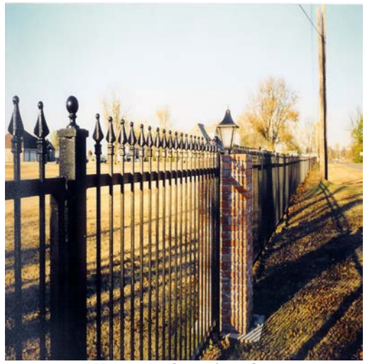
Wrought-iron fencing (Figure 3)

Per Zoning Ordinance Section 507 Tab A: Chain link fencing with plastic or metal slats, sheeting, non-decorative corrugated metal and fencing made or topped with razor, concertina, or barbed wire shall not be used in non-residential development where visible from public streets or adjacent residential areas. Alternatives exist, such as spiked or decorative wrought iron (see figure 3), high walls, and barrier type landscaping that can provide site security without contributing an adverse image to adjoining property.