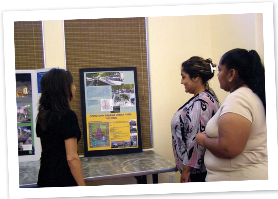
Residents discuss downtown development projects that could impact Central City South.