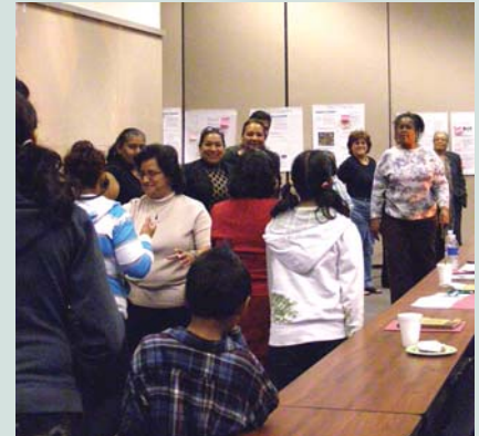
CCS Leadership Academy Conference 2009

As we move into Phase II of the Quality of Life Plan process, detailed action plans addressing community goals and objectives will be developed and implemented. The success of the Implementation Phase will require increased participation by community residents and stakeholders , as well as a wide range of investors, funders, service providers, and businesses who understand the value and potential of our community. We invite anyone interested in the future of our neighborhood to participate and partner in our efforts.