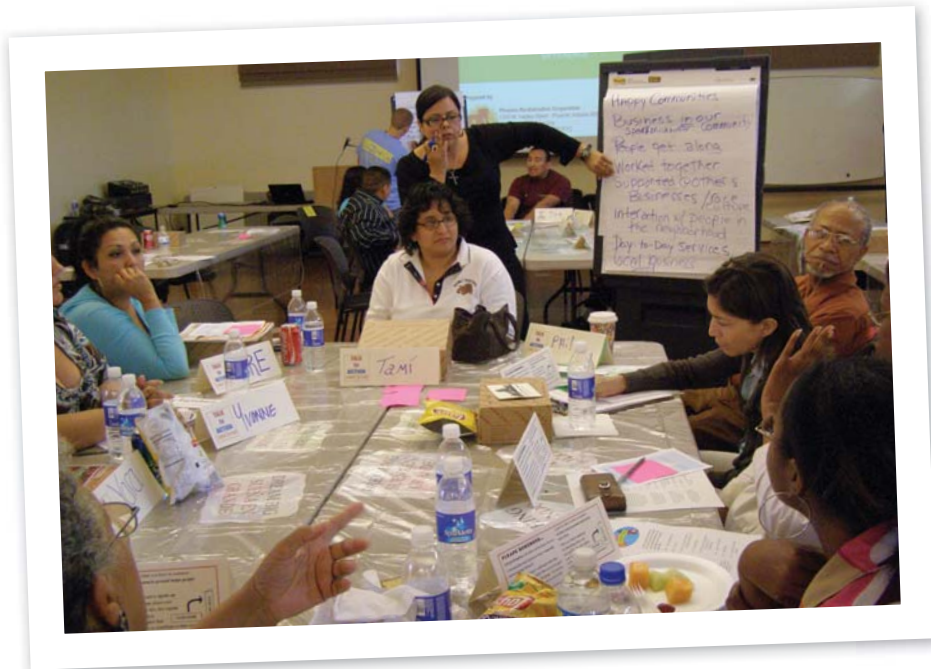
Central City South residents participate in QLP Table Talks in May 2009.