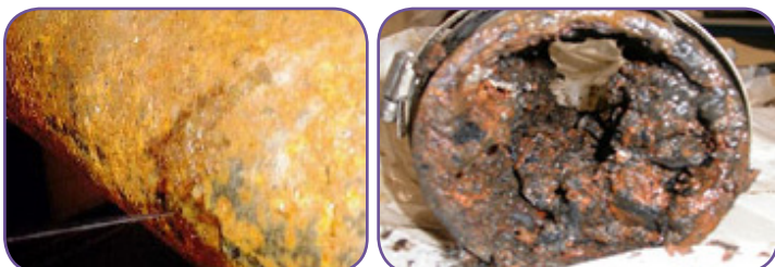
Some repair examples include: Corroded and rusty, leaky pipe (left). Clogged waste pipe (right).