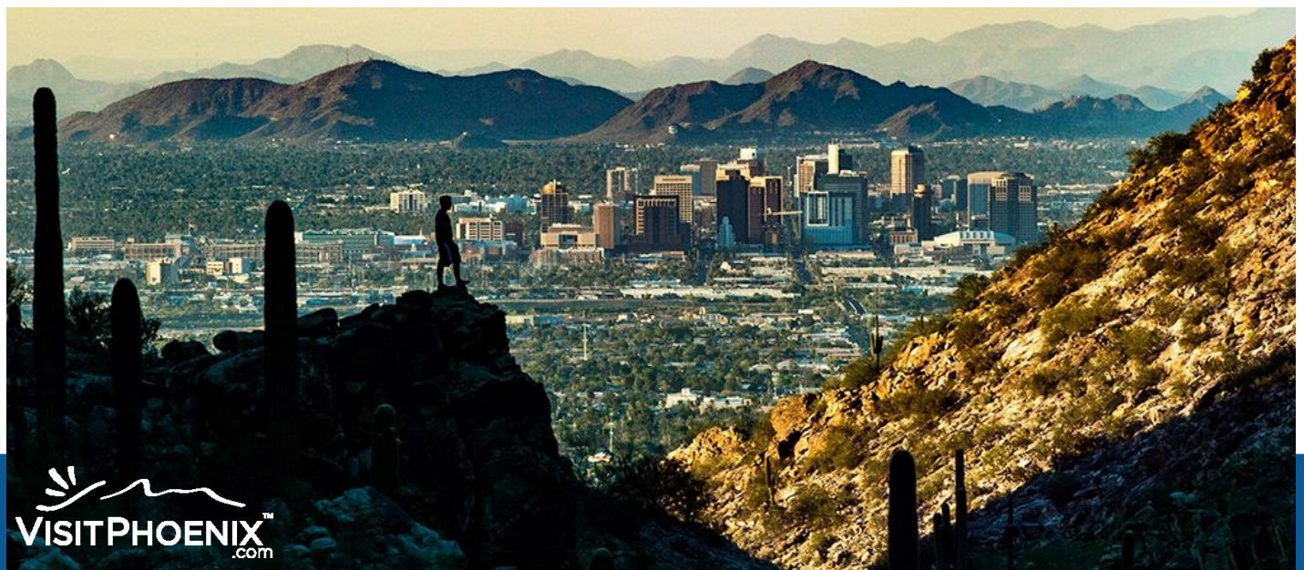
Greg Stanton, Mayor

A handwritten signature in black ink that reads "Greg Stanton". The signature is fluid and cursive, with the first letters of "Greg" and "Stanton" being capitalized and prominent.