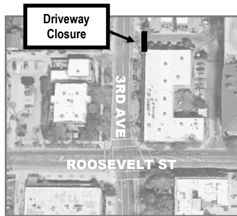
3rd & 5th Avenues Improvement Project ST87100164

If you have any questions, please call our 24-hour project hotline at: (480) 281-1506