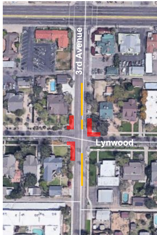
Site Location Map

Please use caution when traveling through the construction areas. We will do our best to minimize disruptions.