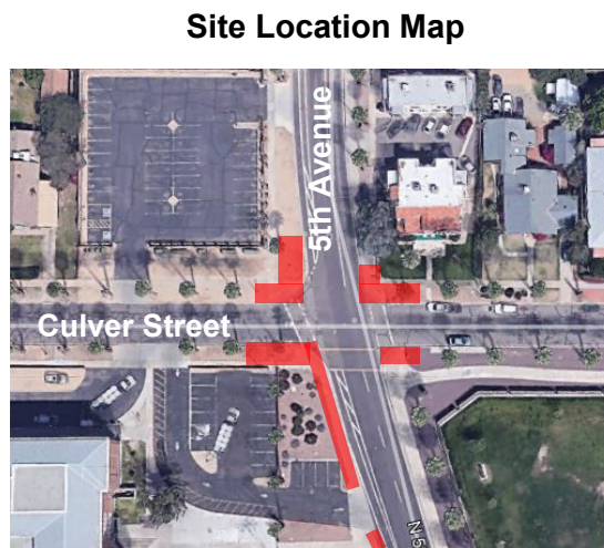
Site Location Map