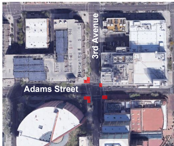
Site Location Map

Please use caution when traveling through the construction areas. We will do our best to minimize disruptions.