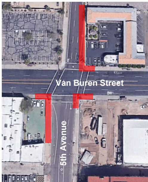
Site Location Map

Please use caution when traveling through the construction areas. We will do our best to minimize disruptions.