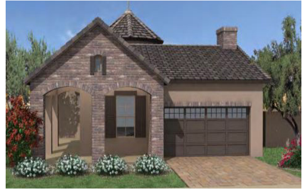
Traditional Manor Elevation

Construction has recently begun on the Rosewood Canyon Estates project. Located at the intersection of Chandler Road and 11th Avenue, Rosewood Canyon Estates is nestled in the foothills of the South Mountain Park Preserve. The site consists of 40 individual single-family lots with scenic mountain views and access to both the Preserve and the open space provided throughout the site.