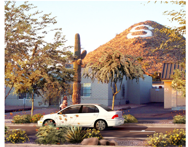
Rendering by Outhouse