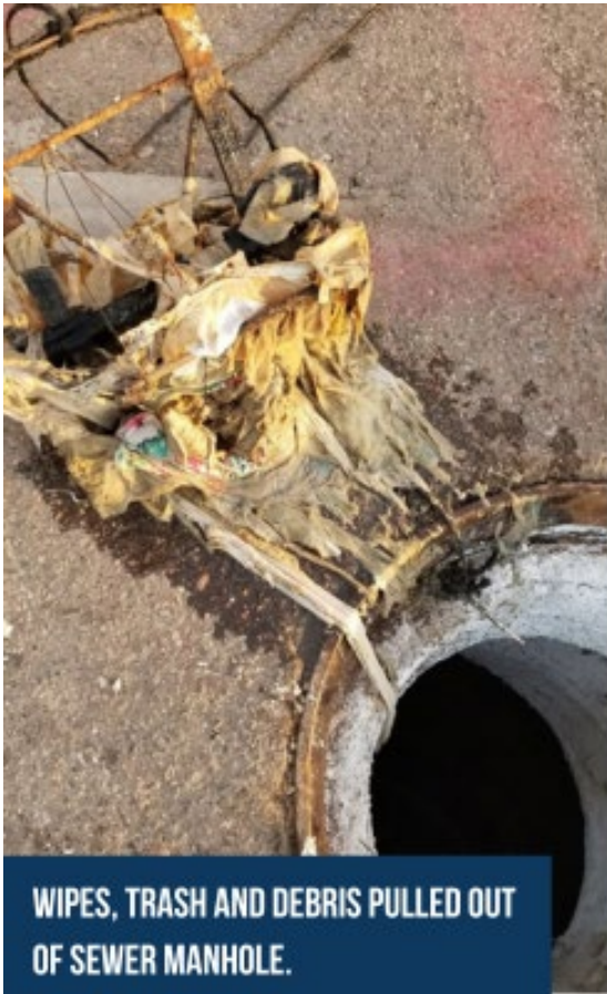
WIPES, TRASH AND DEBRIS PULLED OUT OF SEWER MANHOLE.