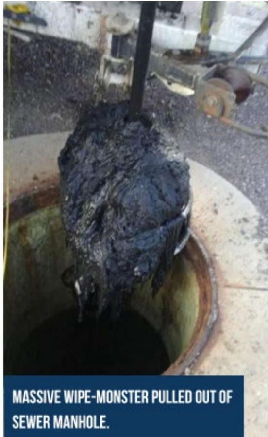
MASSIVE WIPE-MONSTER PULLED OUT OF SEWER MANHOLE.